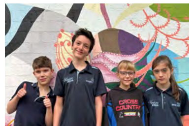
Readers Cup Team

Bridgeway have been taking part in a few different interschool competitions too. Our Knockout Netball team gave their absolute best last week and the soccer team is training hard ready for their upcoming matches. But it isn't just on the sporting field where BPS are competing, we also have a team of senior students taking part in the Adelaide Hills Readers Cup. Competitors read a selection of books and take part in a quiz and performance against other schools.